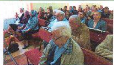
Christians worshipping at the Sacrifice Church in Craiova.