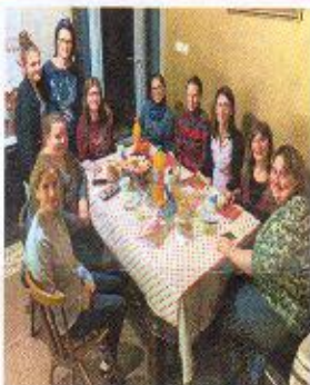
Women's Bible study in Lugoj, Romania

Romania just celebrated her 100 th birthday. (See picture above, left.) There were parades, speeches, and special programs at schools. Children dressed up in traditional costumes and ate traditional foods. This 100-year period includes 42 years of Communism. Despite severe hardships, Christians persevered, knowing that "the government was on His shoulders."