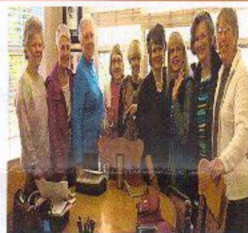
Women's Bible study in Fayetteville, GA

Women all over the world are blessed when they study the Bible together. The fellowship becomes a sisterhood of encouragement. When rough times come, a ready support group is available to help. There is comfort in knowing that the God we study is "the Wonderful Counselor" who walks beside us.