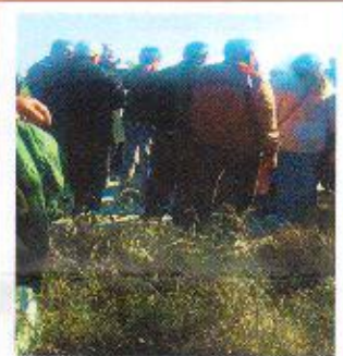
A Gypsy funeral for a man who knew the Everlasting Father .

Women all over the world are blessed when they study the Bible together. The fellowship becomes a sisterhood of encouragement. When rough times come, a ready support group is available to help. There is comfort in knowing that the God we study is "the Wonderful Counselor" who walks beside us.